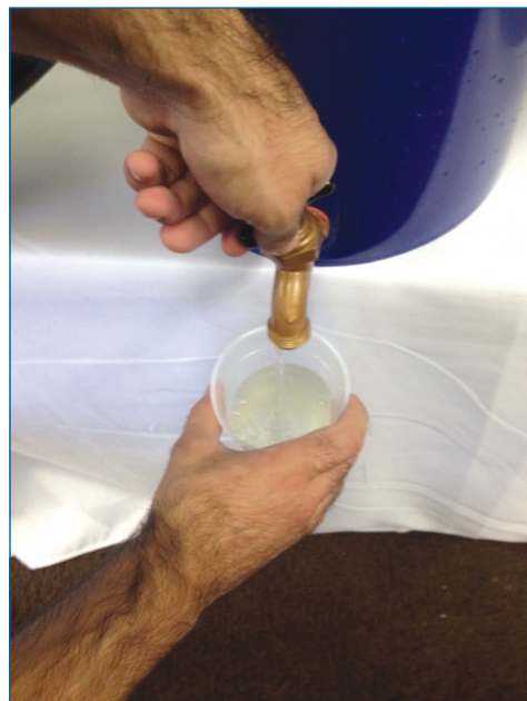
Clean, filtered water.

Director, MAMA Project, for the MAMA Board, Staff and all of the families we serve