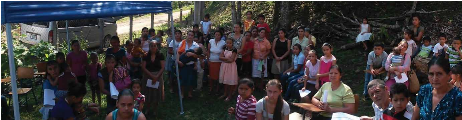
(Below) Community members gather to learn about a health topic when MAMA Service teams visit.