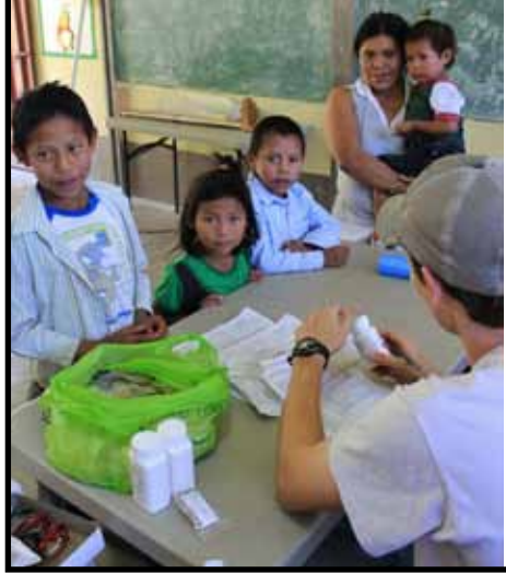
In Lomas Pelonas, a volunteer hands out vitamins.

With help from MAMA's supporters like you, we can continue working in villages like Loma Pelonas, where we can provide medical care and education for the people to improve their health.