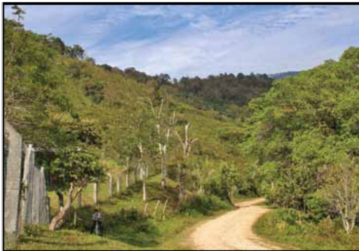
Lomas Pelonas is a beautiful community of Honduras.

It's communities like these where MAMA Project works. MAMA provides help to about 80 villages around the Nutrition Center in the