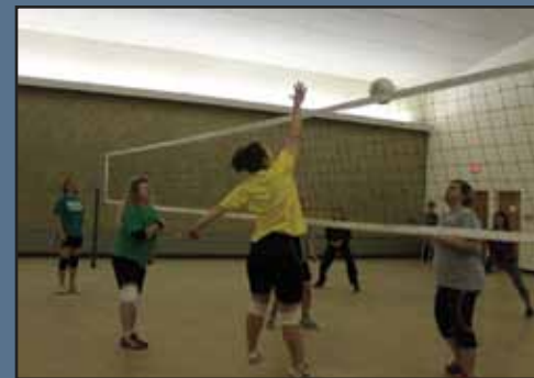
Deep Run East (above left) was the winning team. Bally Mennonite (above right) was the top fundraising team.

We're already planning next year's event that will include a women's tournament as well as a co-ed tournament. Mark your calendars for February 7, 2015 and plan on joining us that day!