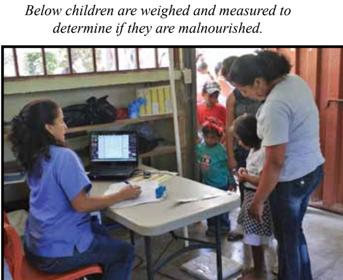
Below children are weighed and measured to determine if they are malnourished.