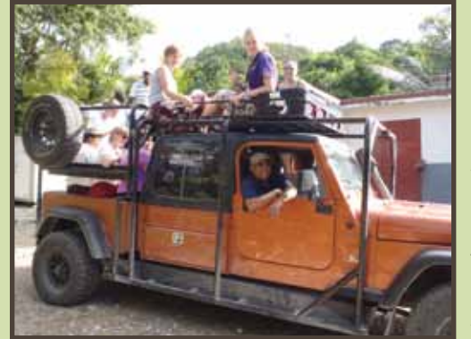
"Hope for Health" Team in Haiti