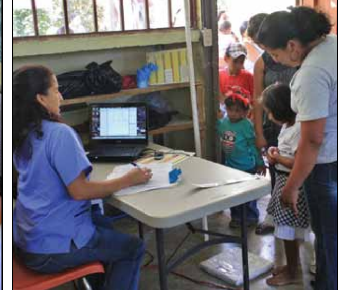
Children are weighed and measured to determine if they are malnourished.